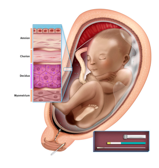
FIGURE 1. Rapid PROM dipstick tests detect premature rupture of fetal membranes (PROM) from amniotic fluid in the vagina.

Distinction between the amniotic fluid and maternal serum IGFBP-1 isoforms is crucial, since up to 20% of women with suspected PROM have vaginal bleeding<sup>8</sup>. Accordingly, PROM test validation studies that have excluded from the study population women with bleeding may not accurately demonstrate test performance in a clinical setting<sup>9</sup>.